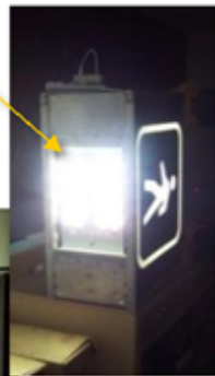
High Output LED Down light