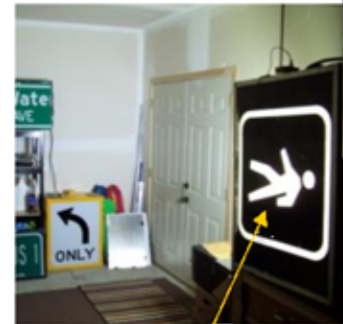
Bright, White LED Light